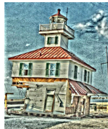
1st place in manipulated Bud Logan