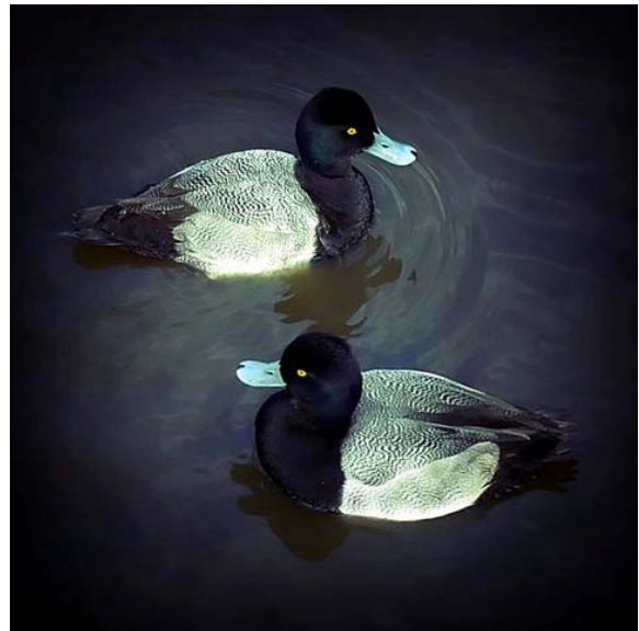
Assigned Yellow Eye Lesser Scaup Tom Zacarria