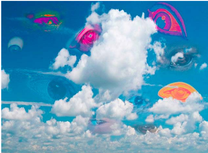
Creative Eyes in the Sky Tom Oelsner