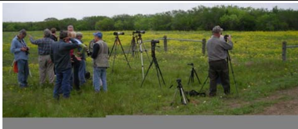
Workshop Group at Fennessey Ranch

Most participants were a bit tired, but felt that they had an enjoyable and productive session.